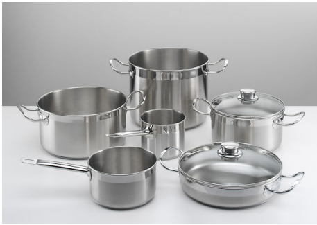
Induction Pro - Cookware set - 8pcs